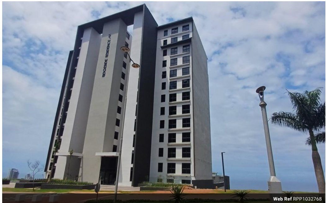
Web Ref RPP1032768

Shop 5 7 on Millennium Boulevard Umhlanga Ridge 4321