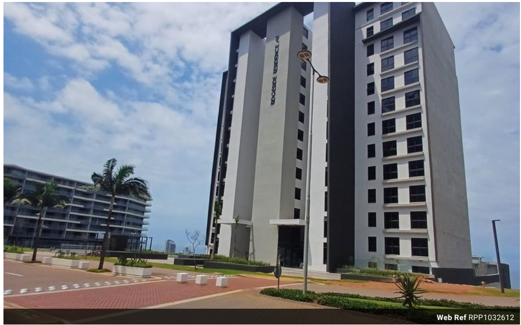
Web Ref RPP1032612

Shop 5 7 on Millennium Boulevard Umhlanga Ridge 4321