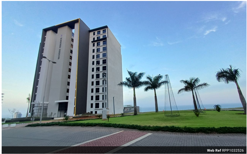
Web Ref RPP1032526

Shop 5 7 on Millennium Boulevard Umhlanga Ridge 4321