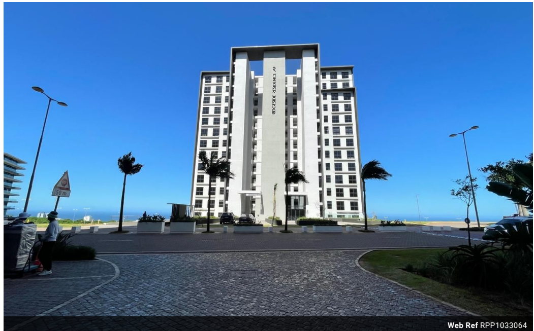
Web Ref RPP1033064

Shop 5 7 on Millennium Boulevard Umhlanga Ridge 4321