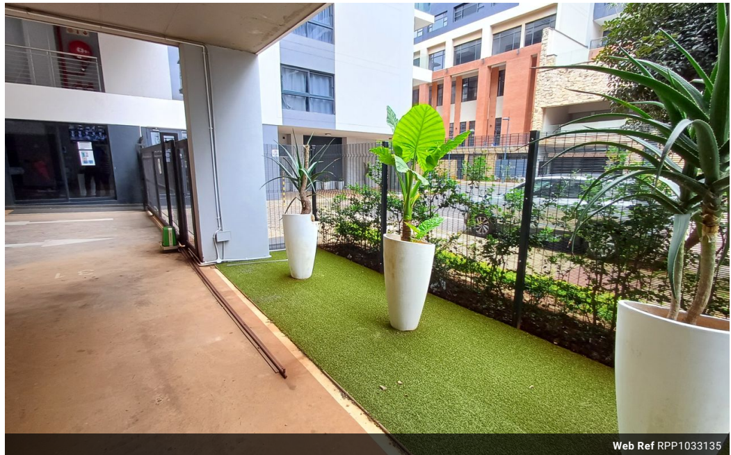
Web Ref RPP1033135

Shop 5 7 on Millennium Boulevard Umhlanga Ridge 4321