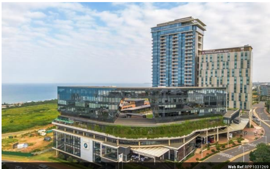
Web Ref RPP1031269

Shop 5 7 on Millennium Boulevard Umhlanga Ridge 4321