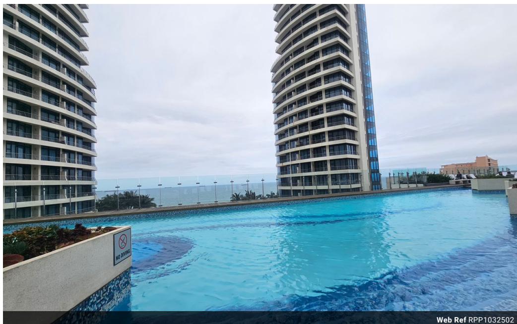
Web Ref RPP1032502

Shop 5 7 on Millennium Boulevard Umhlanga Ridge 4321