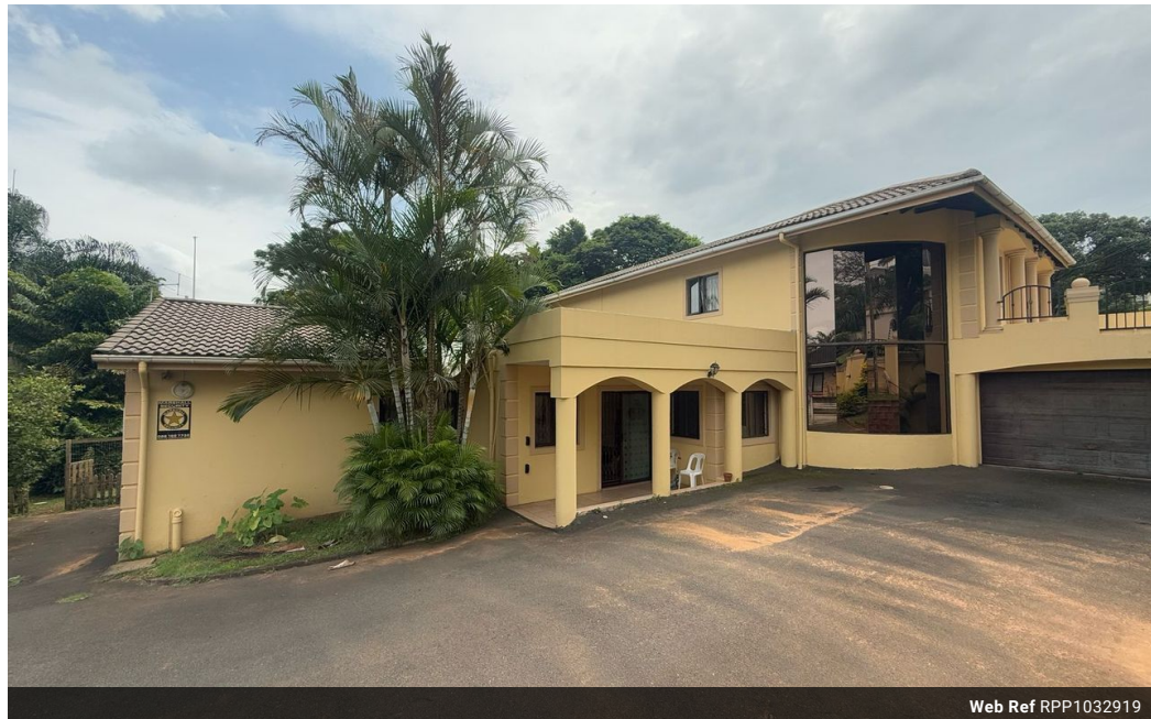
Web Ref RPP1032919

Shop 5 7 on Millennium Boulevard Umhlanga Ridge 4321