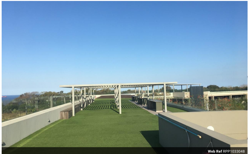
Web Ref RPP1033048

Shop 5 7 on Millennium Boulevard Umhlanga Ridge 4321