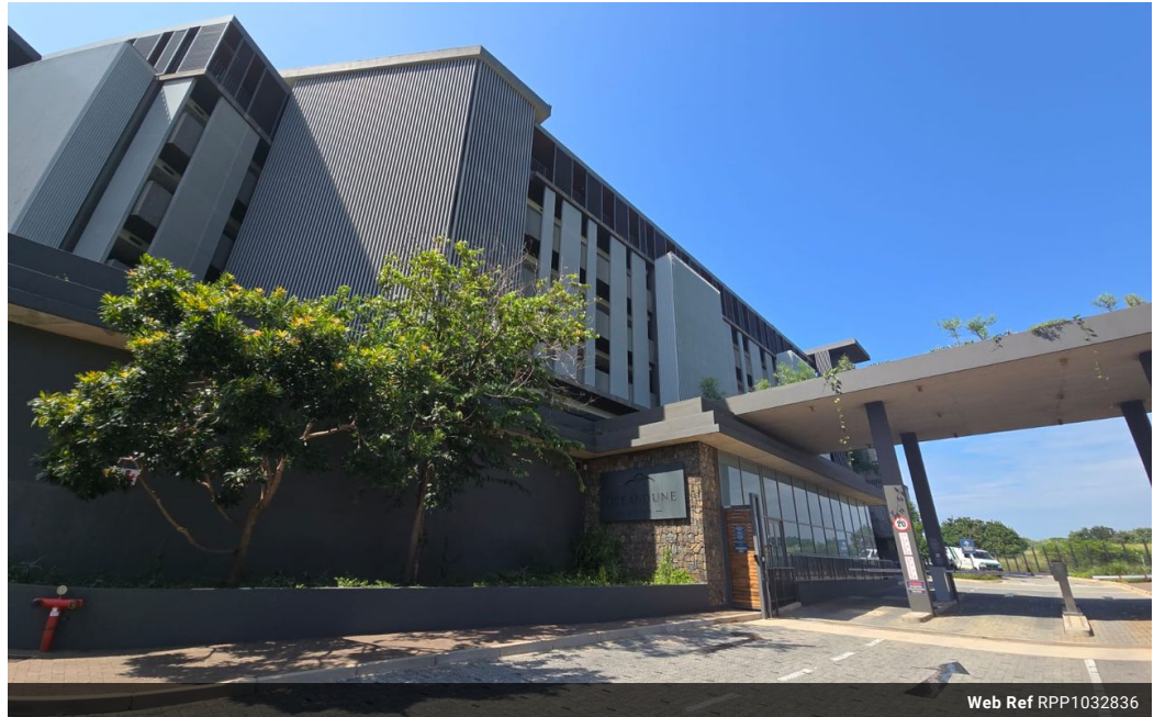
Web Ref RPP1032836

Shop 5 7 on Millennium Boulevard Umhlanga Ridge 4321