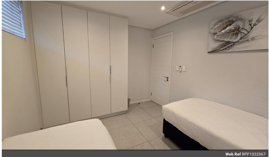
Web Ref RPP1032367

Shop 5 7 on Millennium Boulevard Umhlanga Ridge 4321