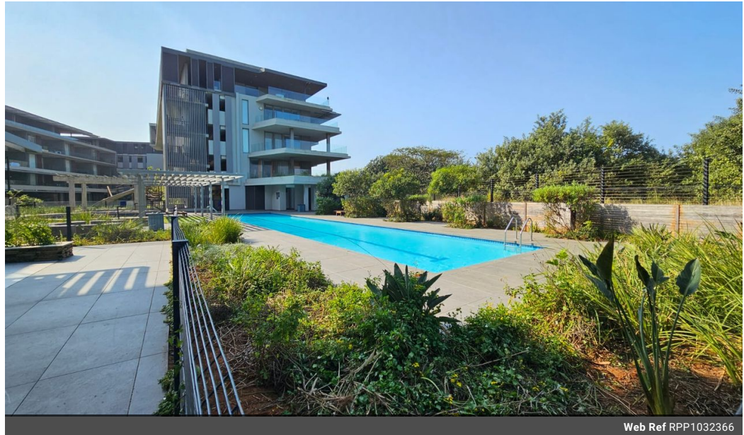
Web Ref RPP1032366

Shop 5 7 on Millennium Boulevard Umhlanga Ridge 4321