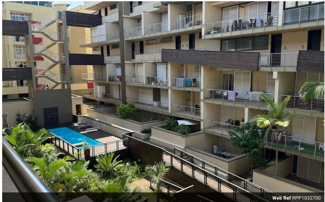
Web Ref RPP1032700

Shop 5 7 on Millennium Boulevard Umhlanga Ridge 4321