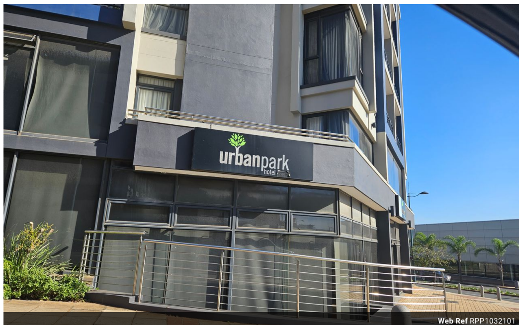
Web Ref RPP1032101

Shop 5 7 on Millennium Boulevard Umhlanga Ridge 4321