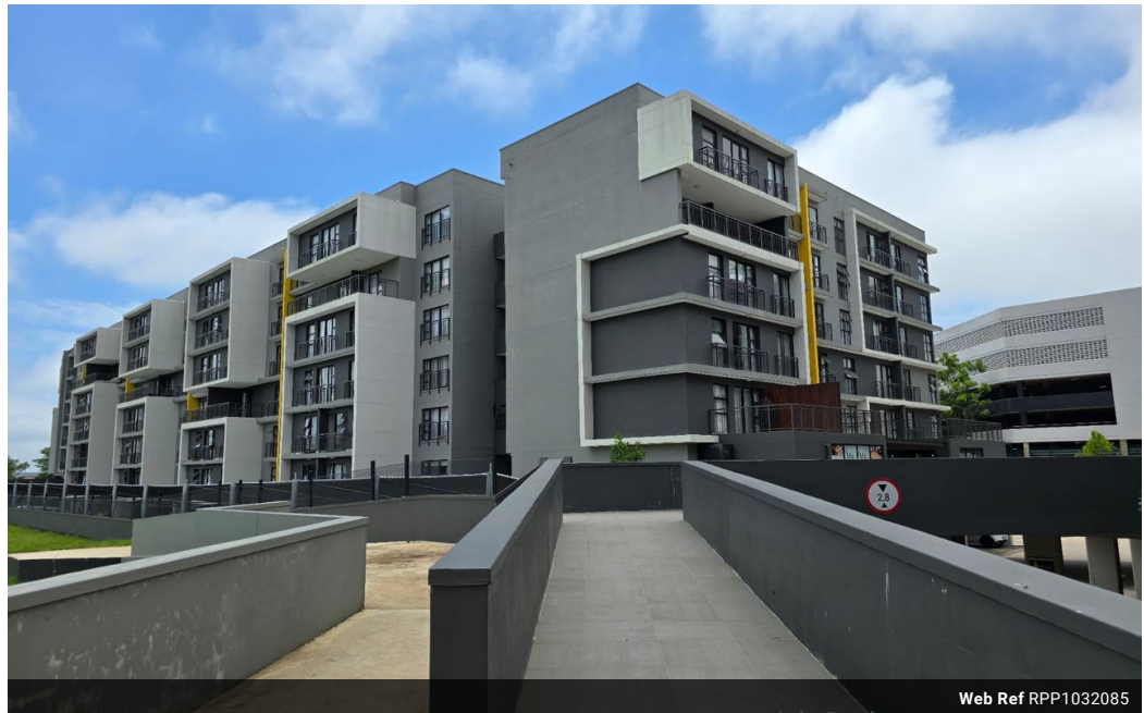
Web Ref RPP1032085

Shop 5 7 on Millennium Boulevard Umhlanga Ridge 4321