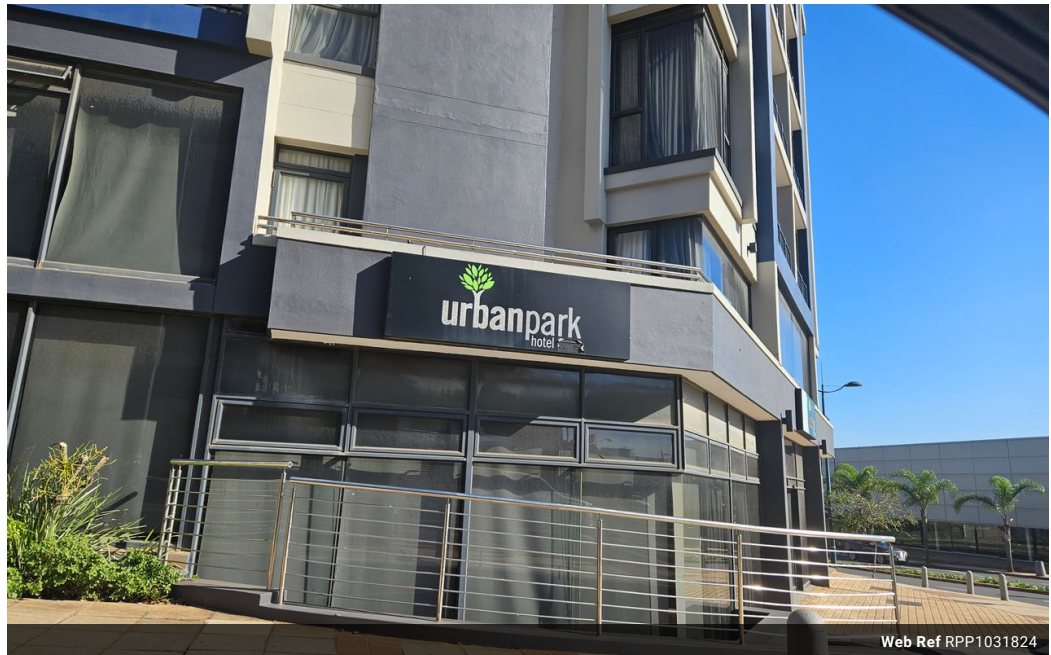
Web Ref RPP1031824

Shop 5 7 on Millennium Boulevard Umhlanga Ridge 4321