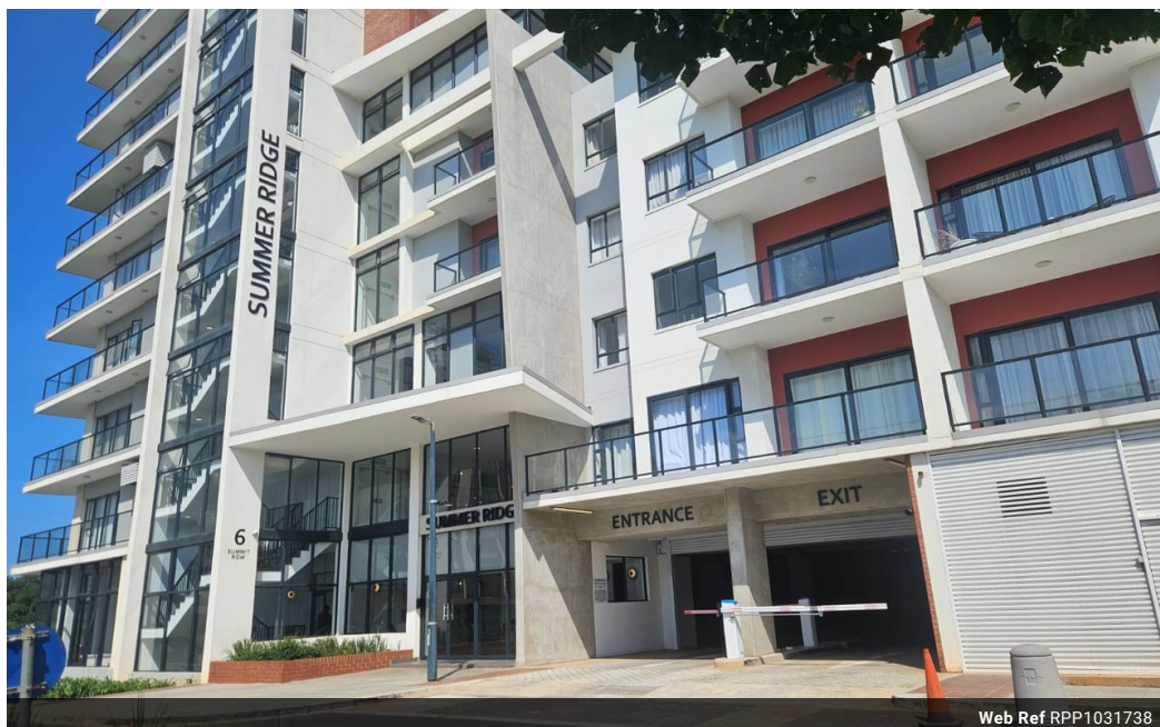
Web Ref RPP1031738

Shop 5 7 on Millennium Boulevard Umhlanga Ridge 4321