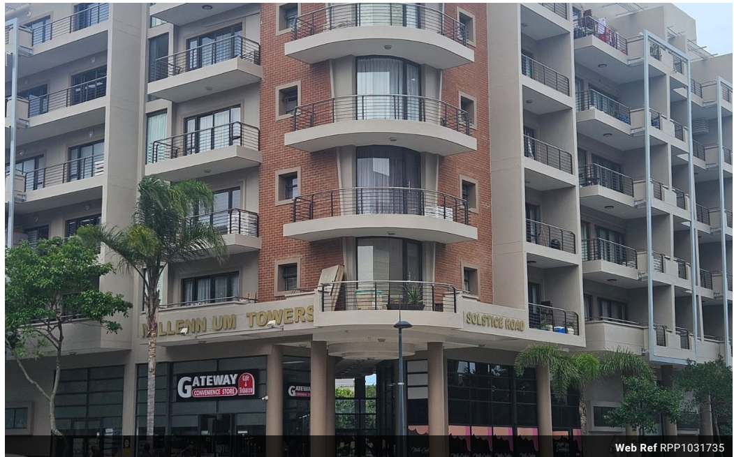
Web Ref RPP1031735

Shop 5 7 on Millennium Boulevard Umhlanga Ridge 4321