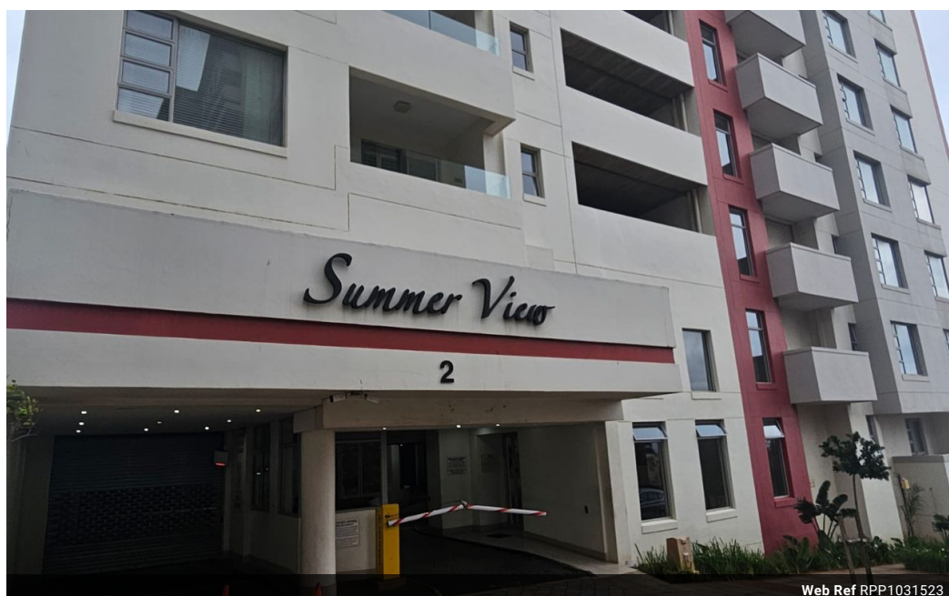
Web Ref RPP1031523

Shop 5 7 on Millennium Boulevard Umhlanga Ridge 4321