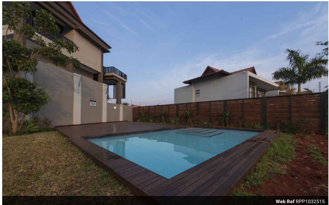
Web Ref RPP1032515

Shop 5 7 on Millennium Boulevard Umhlanga Ridge 4321