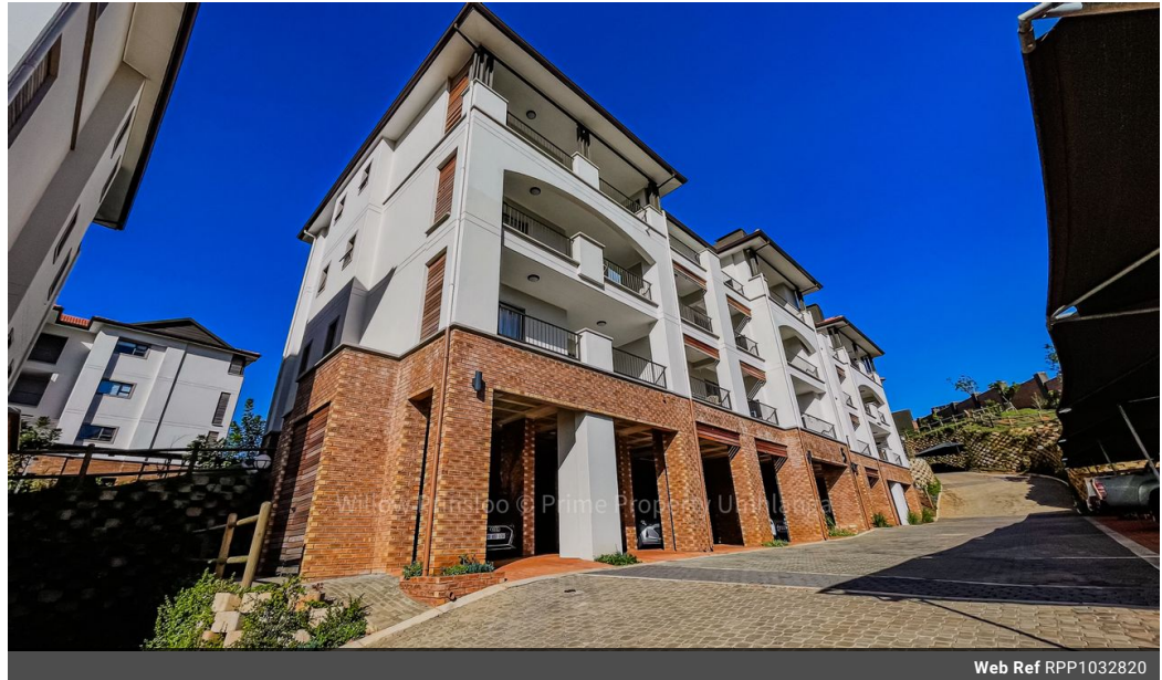
Web Ref RPP1032820

Shop 5 7 on Millennium Boulevard Umhlanga Ridge 4321