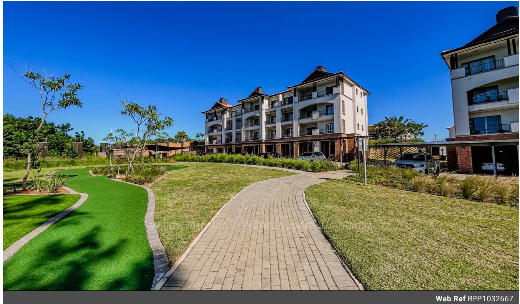
Web Ref RPP1032667

Shop 5 7 on Millennium Boulevard Umhlanga Ridge 4321