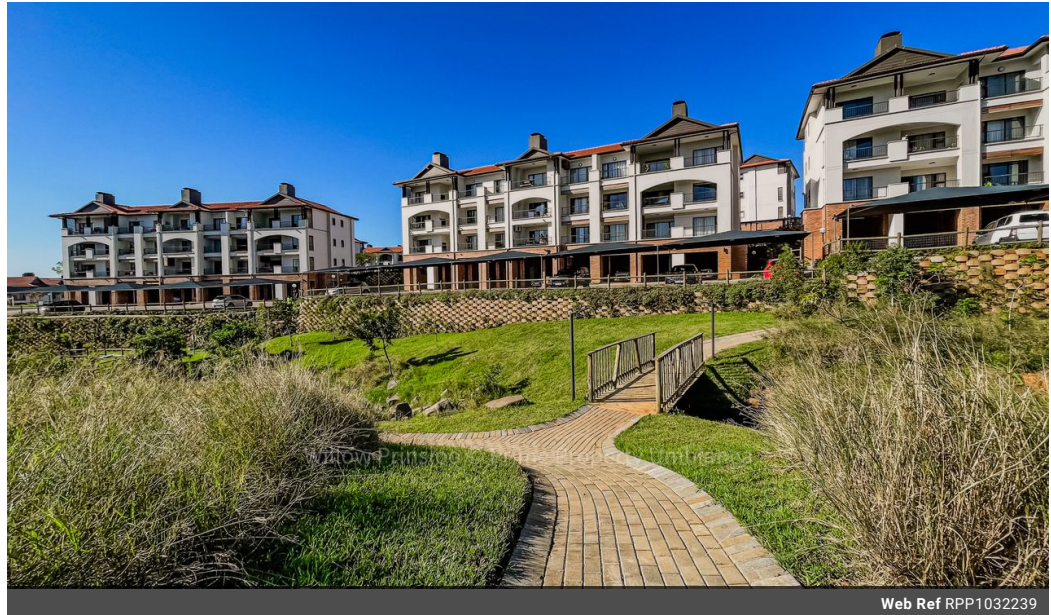
Web Ref RPP1032239

Shop 5 7 on Millennium Boulevard Umhlanga Ridge 4321