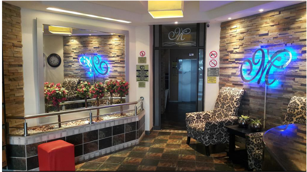
Web Ref RPP22855

Shop 5, 7 on Millennium 7 Millennium Boulevard Umhlanga 4319