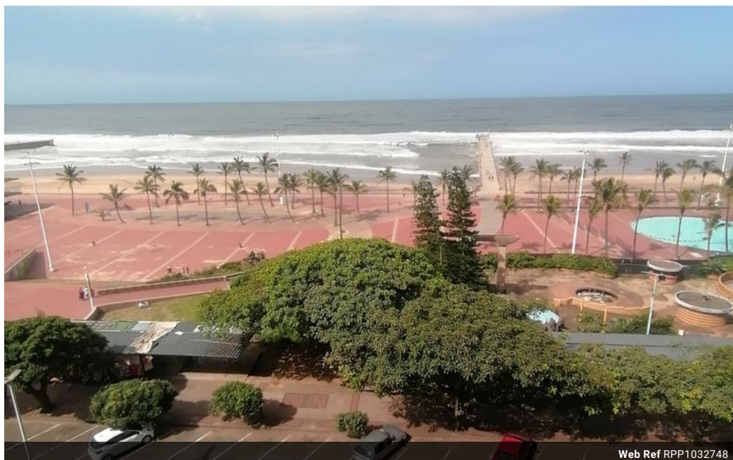
Web Ref RPP1032748

Shop 5 7 on Millennium Boulevard Umhlanga Ridge 4321