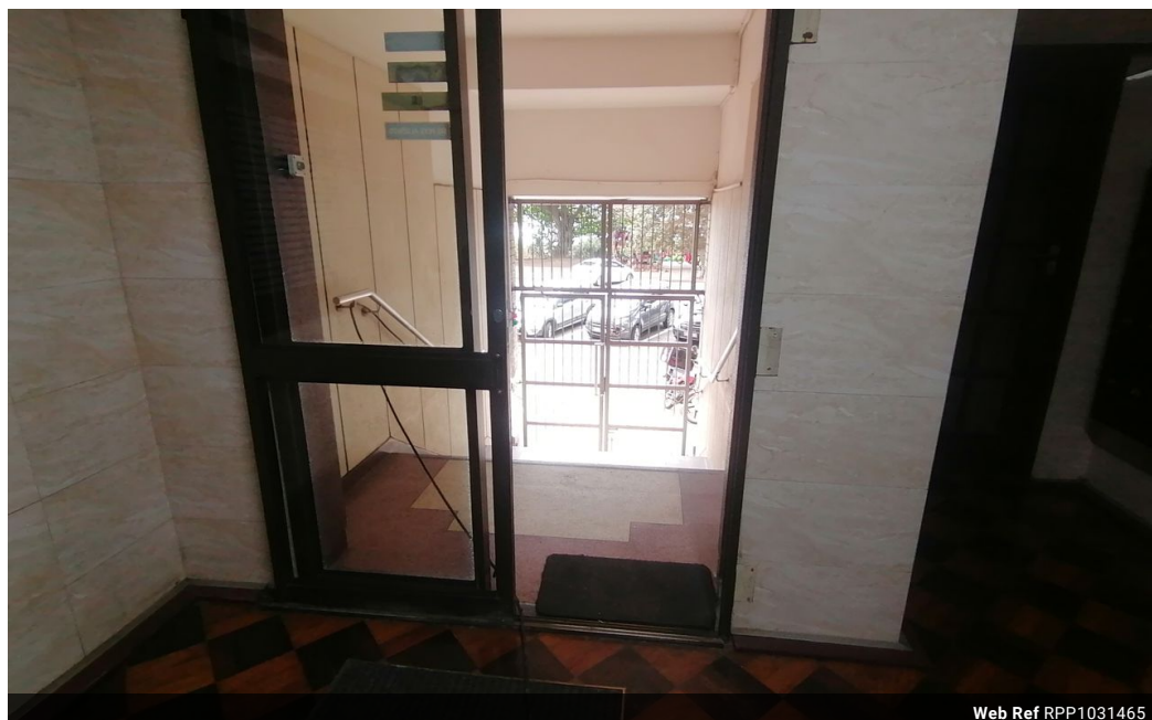
Web Ref RPP1031465

Shop 5 7 on Millennium Boulevard Umhlanga Ridge 4321