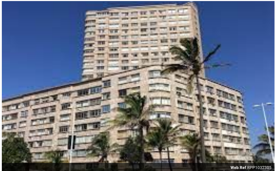
Web Ref RPP1032305

Shop 5 7 on Millennium Boulevard Umhlanga Ridge 4321