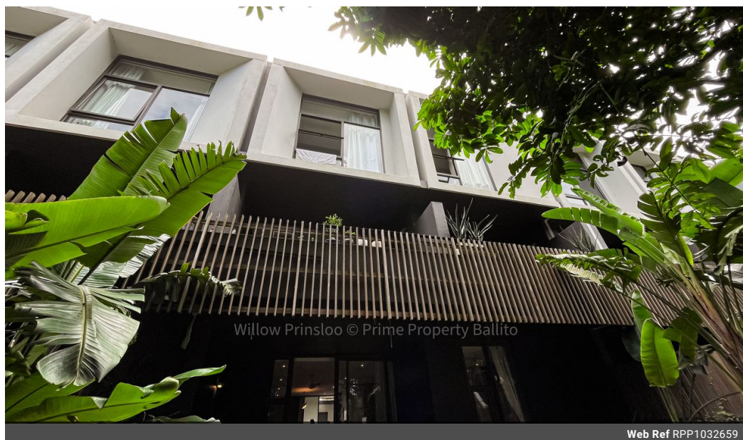
Willow Prinsloo © Prime Property Ballito

Shop 5 7 on Millennium Boulevard Umhlanga Ridge 4321