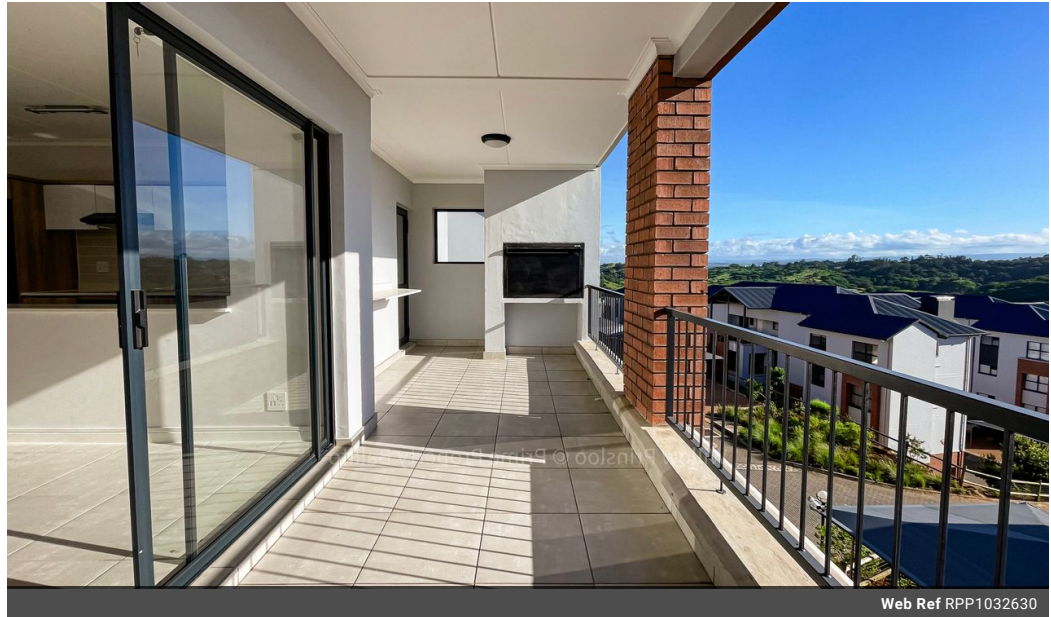
Web Ref RPP1032630

Shop 5 7 on Millennium Boulevard Umhlanga Ridge 4321