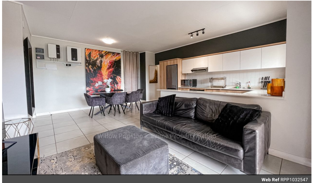
Web Ref RPP1032547

Shop 5 7 on Millennium Boulevard Umhlanga Ridge 4321