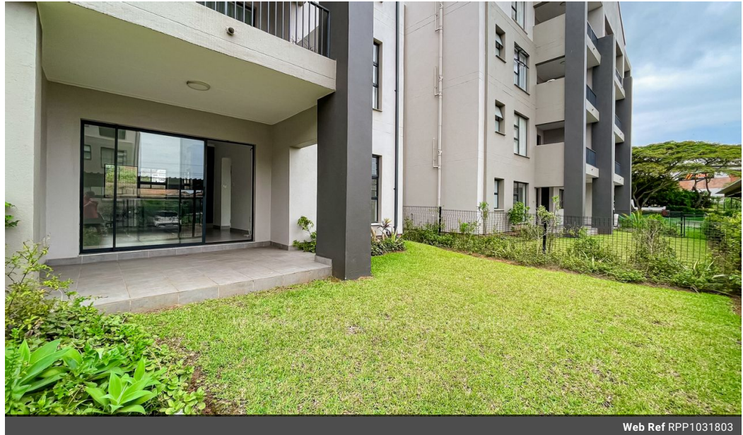
Web Ref RPP1031803

Shop 5 7 on Millennium Boulevard Umhlanga Ridge 4321