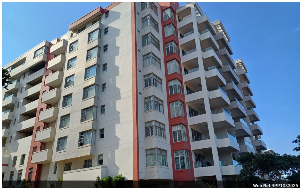
Web Ref RPP1033035

Shop 5 7 on Millennium Boulevard Umhlanga Ridge 4321