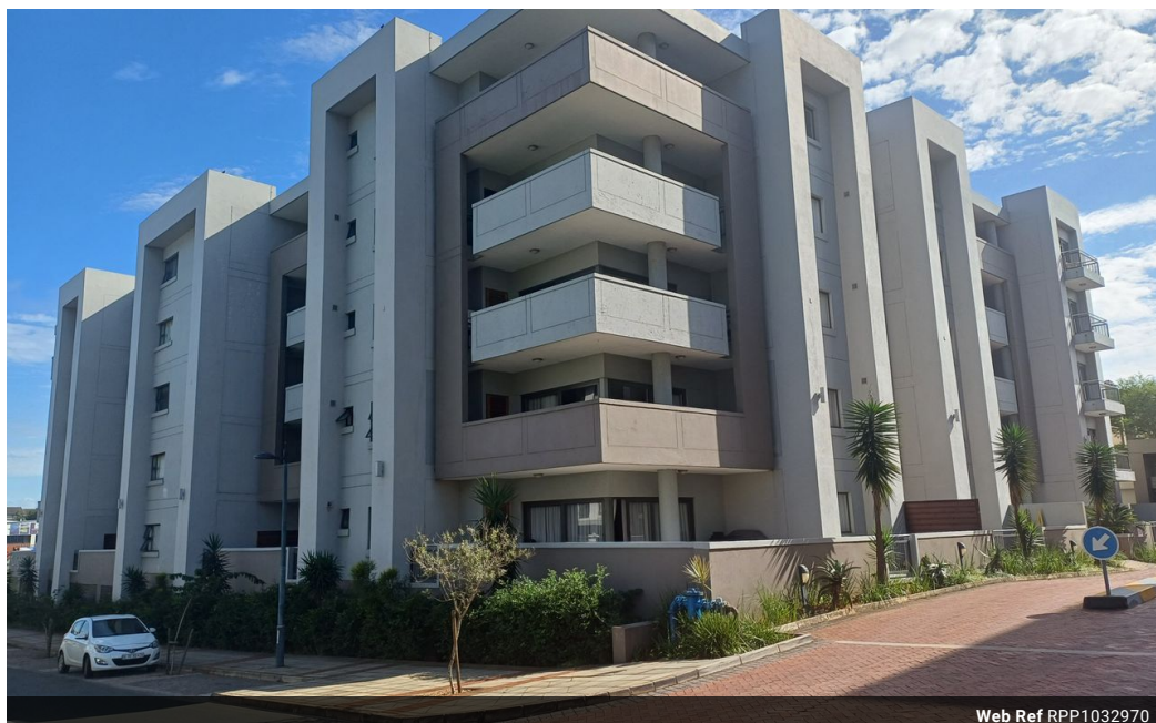
Web Ref RPP1032970

Shop 5 7 on Millennium Boulevard Umhlanga Ridge 4321