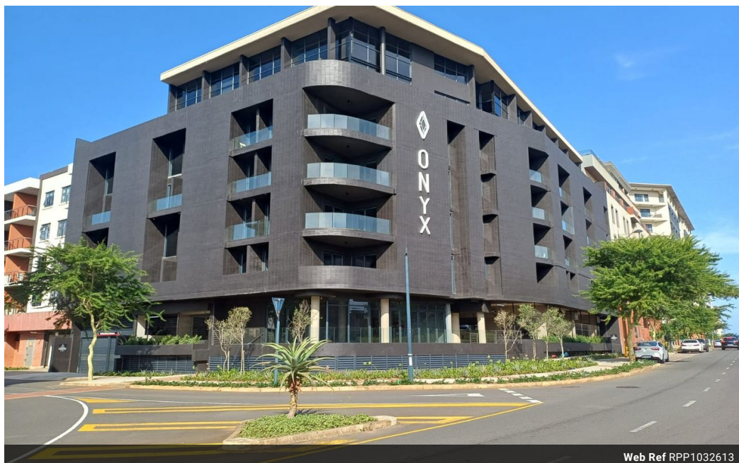
Web Ref RPP1032613

Shop 5 7 on Millennium Boulevard Umhlanga Ridge 4321