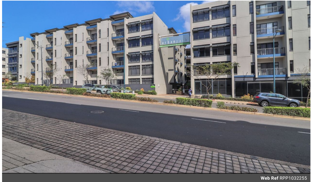
Web Ref RPP1032255

Shop 5 7 on Millennium Boulevard Umhlanga Ridge 4321