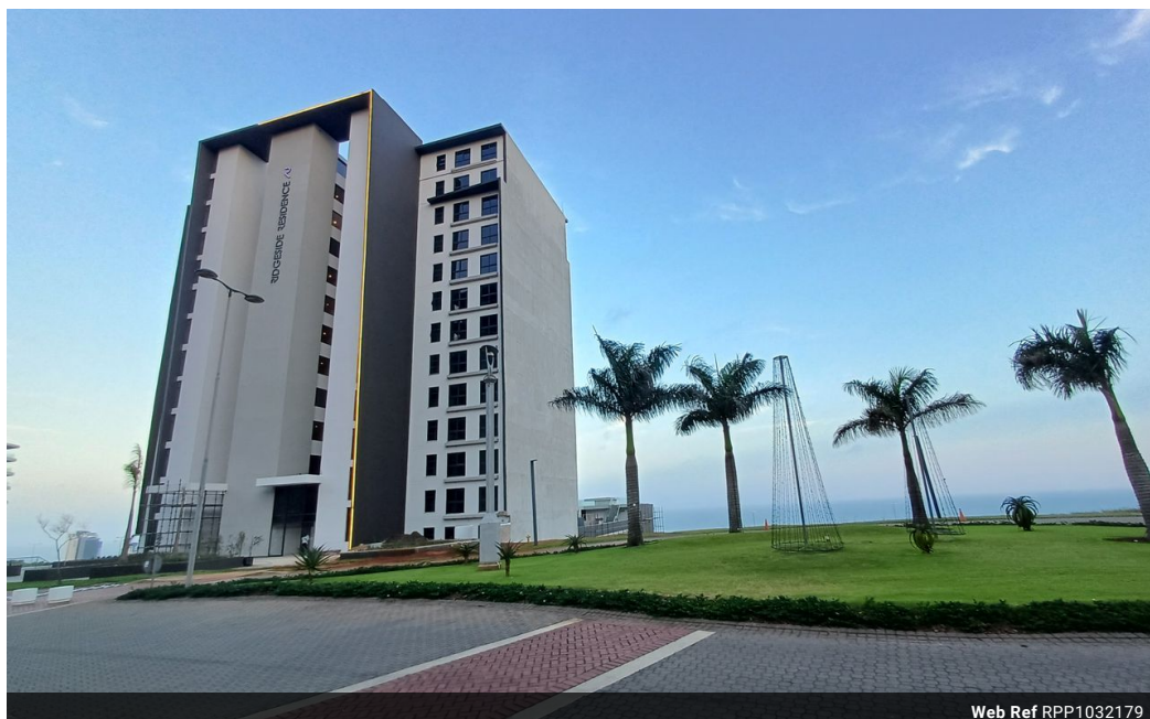
Web Ref RPP1032179

Shop 5 7 on Millennium Boulevard Umhlanga Ridge 4321