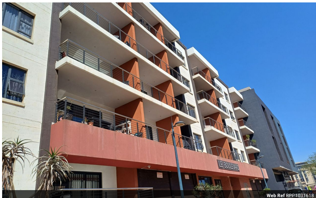
Web Ref RPP1031618

Shop 5 7 on Millennium Boulevard Umhlanga Ridge 4321