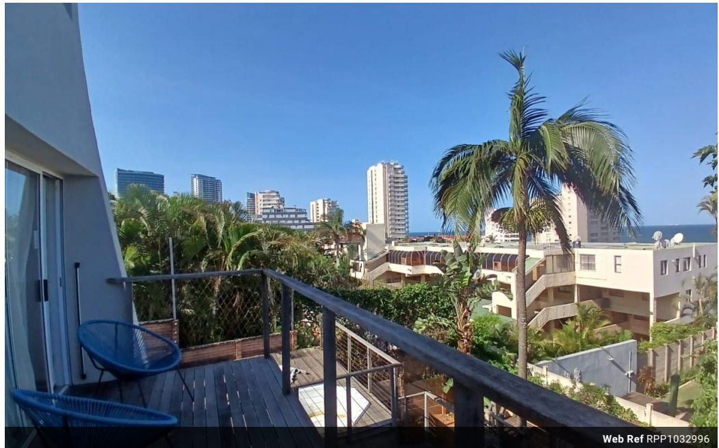
Web Ref RPP1032996

Shop 5 7 on Millennium Boulevard Umhlanga Ridge 4321