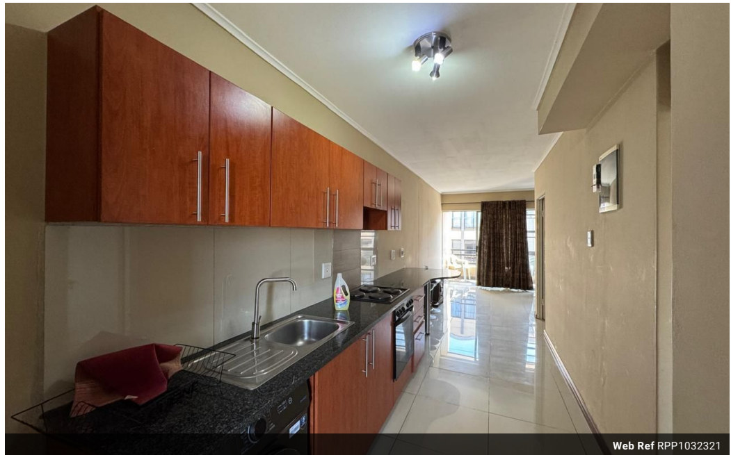
Web Ref RPP103231

Shop 5 7 on Millennium Boulevard Umhlanga Ridge 4321