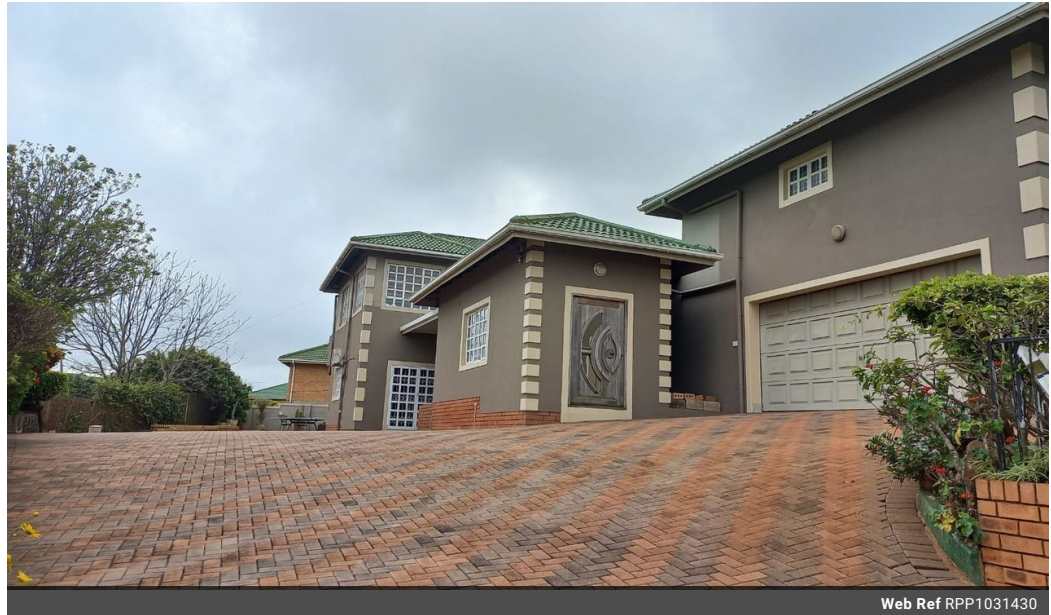
Web Ref RPP1031430

Shop 5 7 on Millennium Boulevard Umhlanga Ridge 4321