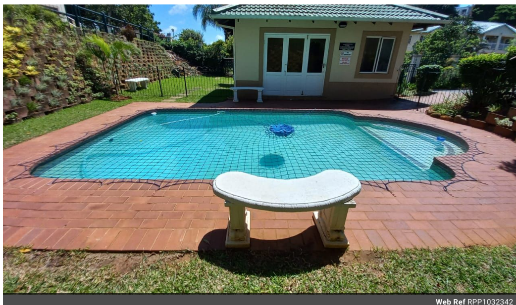
Web Ref RPP1032342

Shop 5 7 on Millennium Boulevard Umhlanga Ridge 4321