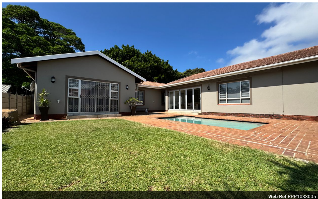
Web Ref RPP1033005

Shop 5 7 on Millennium Boulevard Umhlanga Ridge 4321