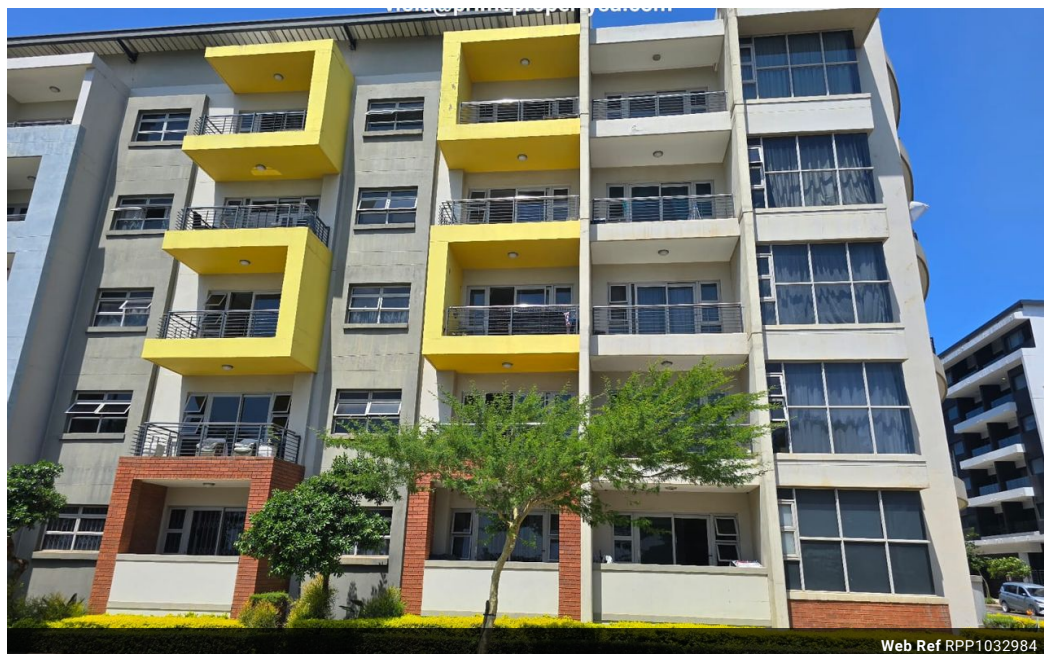
Web Ref RPP1032984

Shop 5 7 on Millennium Boulevard Umhlanga Ridge 4321