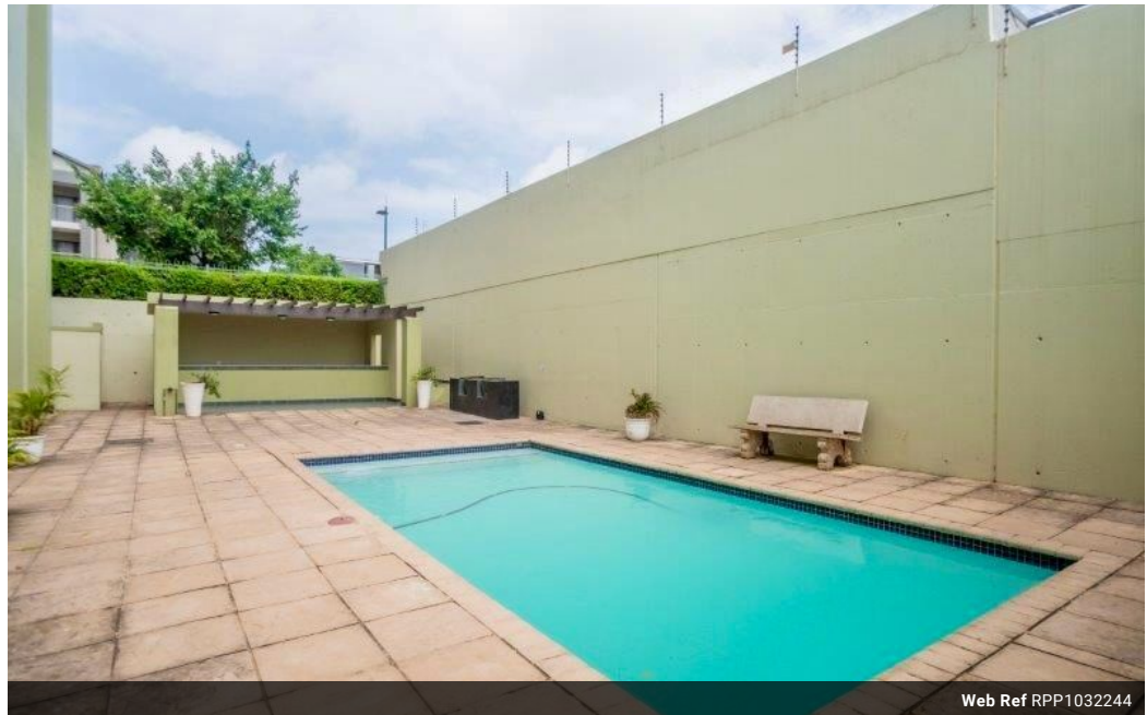
Web Ref RPP1032244

Shop 5 7 on Millennium Boulevard Umhlanga Ridge 4321