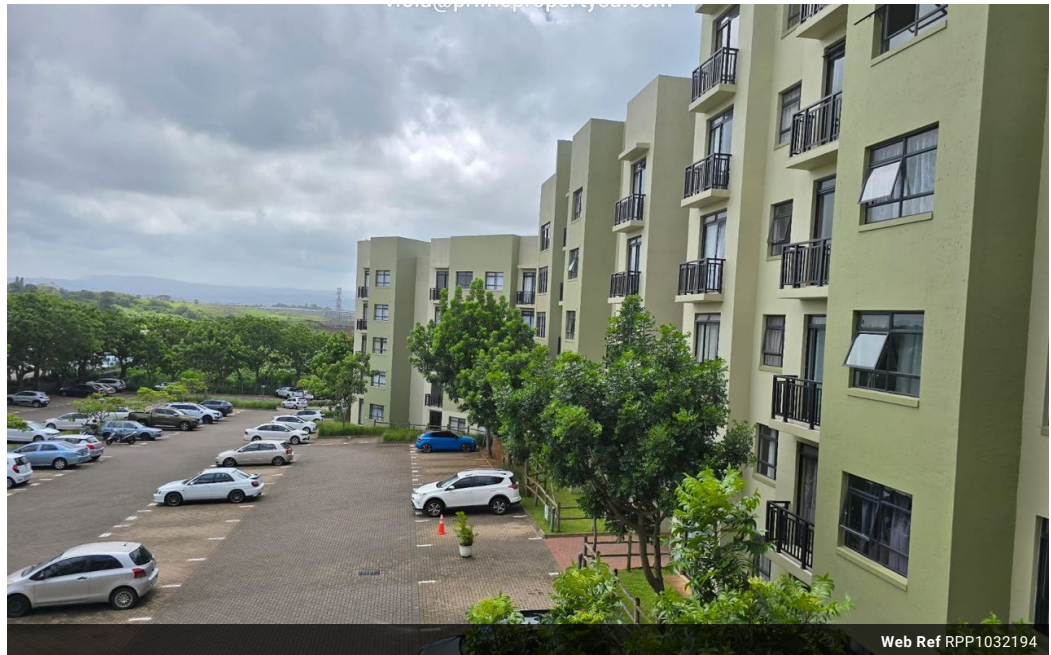
Web Ref RPP1032194

Shop 5 7 on Millennium Boulevard Umhlanga Ridge 4321