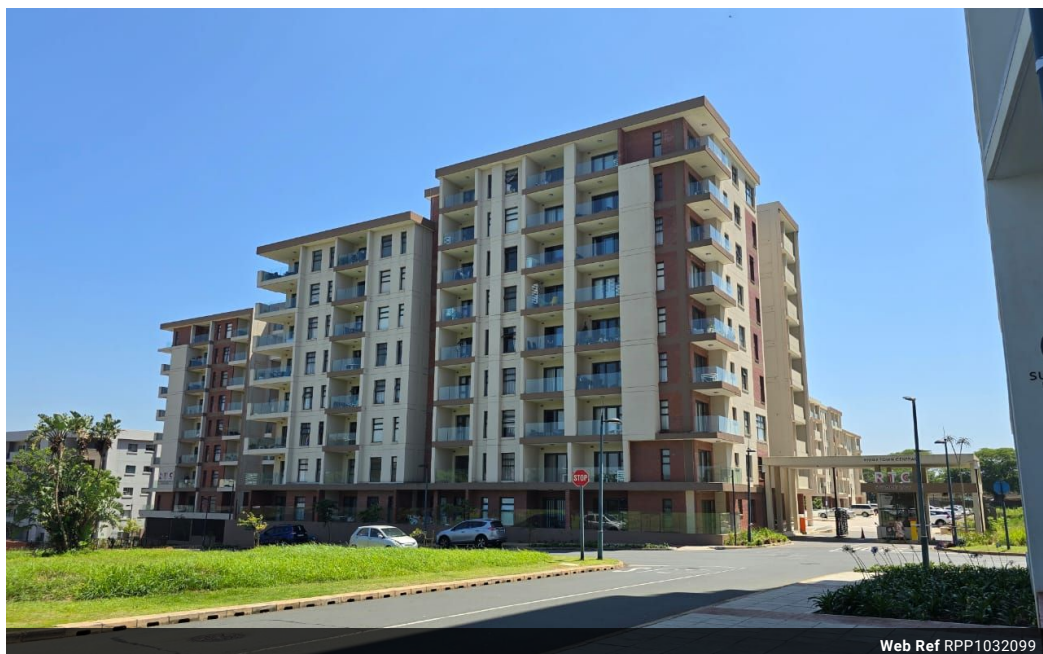
Web Ref RPP1032099

Shop 5 7 on Millennium Boulevard Umhlanga Ridge 4321