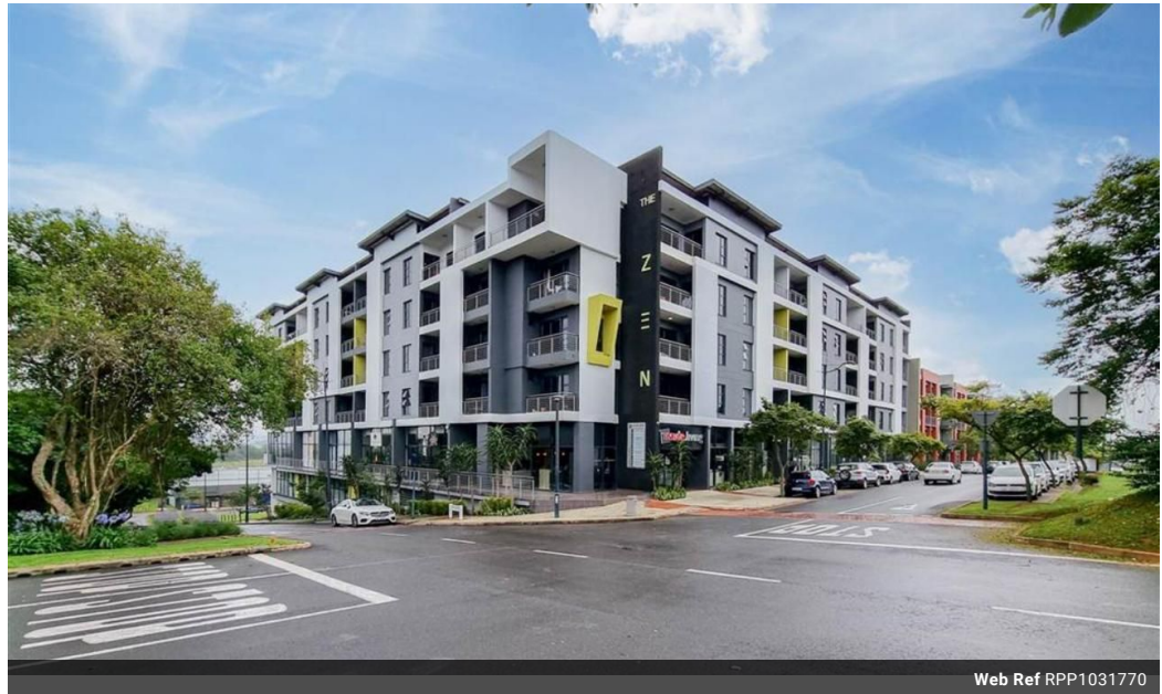
Web Ref RPP1031770

Shop 5 7 on Millennium Boulevard Umhlanga Ridge 4321