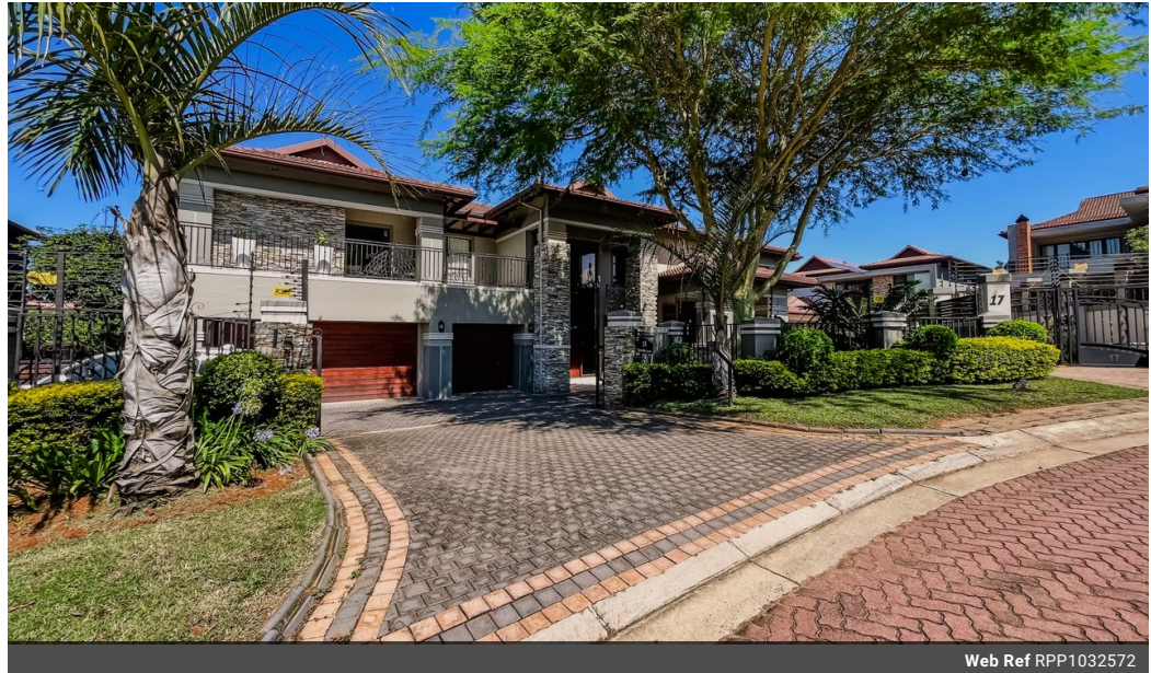
Web Ref RPP1032572

Shop 5 7 on Millennium Boulevard Umhlanga Ridge 4321