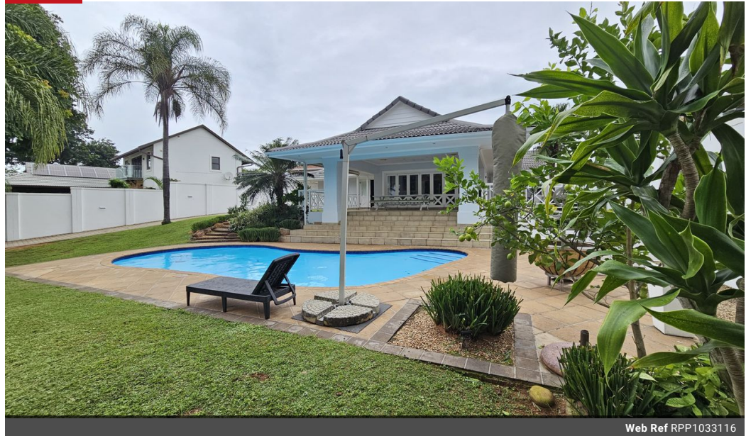
Web Ref RPP1033116