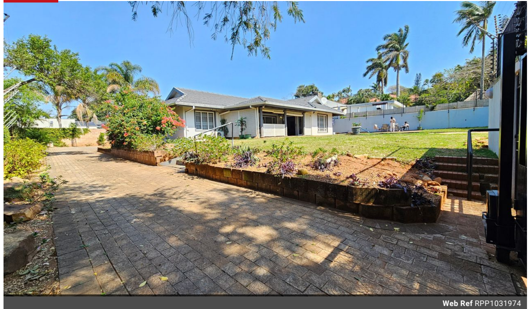
Web Ref RPP1031974